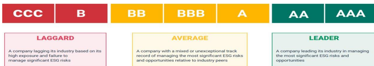
Figure 2: MSCI ESG Rating summary table.

The provider MSCI ESG Research also assigns a score and rating at the fund level (ESG Fund Rating)